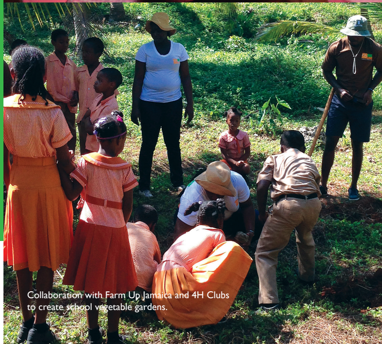
Collaboration with Farm Up Jamaica and 4H Clubs to create school vegetable gardens.